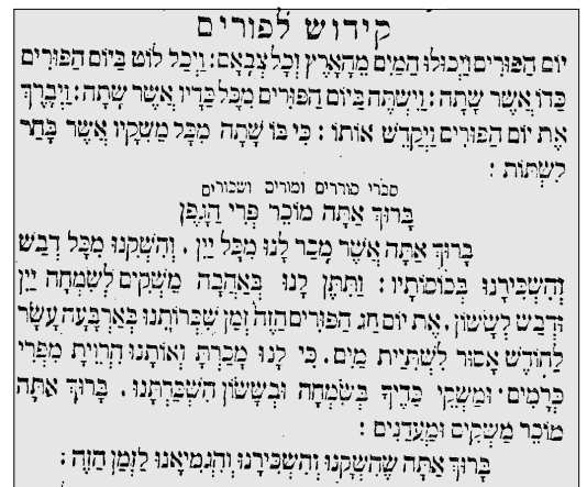
The complete text of the ancient Kiddush pays tribute to the importance of wine and the prohibition of drinking water on Purim.

There was no immediate explanation of how such an ancient scroll could be found in America, but local rabbis were immediately confounded by the halachic issues presented by the find. An emergency meeting of the RCBC was convened at which it was decreed that all Fair Lawn residents must recite the kiddush this year. Furthermore, the rabbis declared, each person, having made Kiddush, must consume at least one gallon of wine and eat at least four hamantashen, with each hamantash being at least the size of a pack of baseball cards (without the gum).